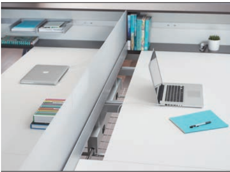
Standard Sliding Tops

Eleven Workspace is a seamless blend of functionality, connectivity, storage, and media integration that harmonizes with interior architecture. Integrated sit to stand design invites collaboration and accommodates varied work styles. Standard sliding tops create quick, access to power and data when open and a clean, aesthetic when closed. A storage box applied to the end of a run can create not only space division but also a return.