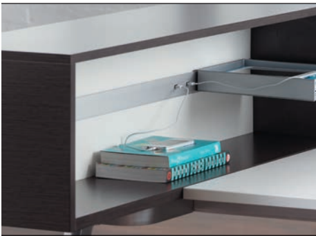
Built-In Personal Charging