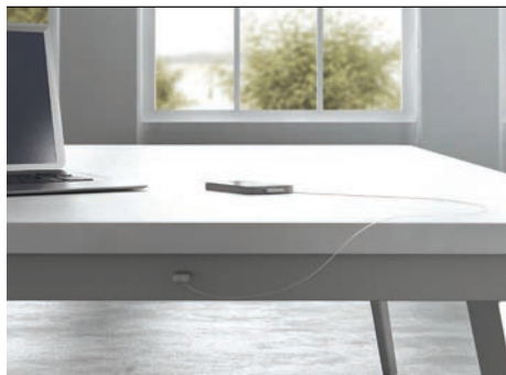
Trace Banding with Embedded Connectors