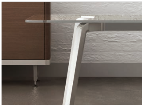
Die Cast Polished Aluminum Leg