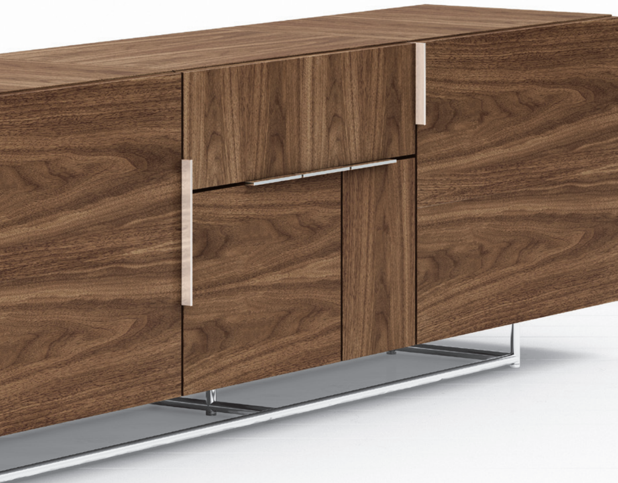
Mixed storage credenza, 26" high × 118" wide