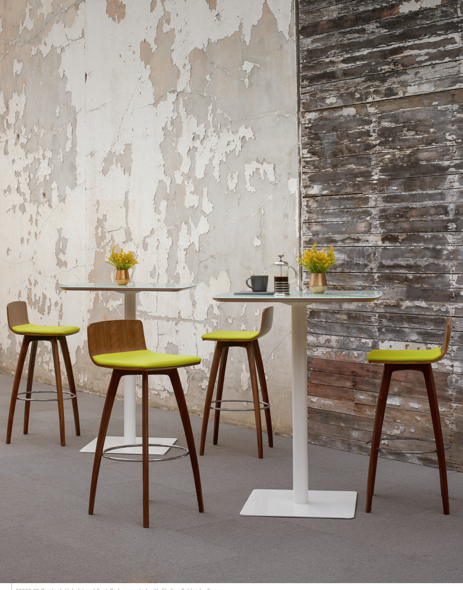
#3320-30 Barstool, Upholstered Seat Pad, presented with Skyline Tables by Encore