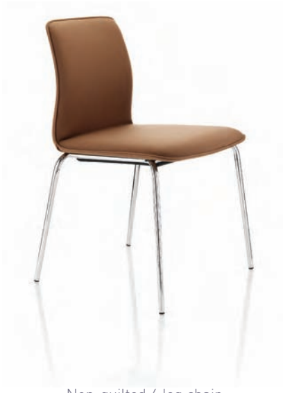
Non-quilted 4 leg chair