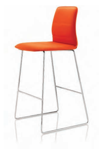
Quilted bar stool on a skid base

The range comprises of a chair that can be specified as either a four legged chair or with a skid base and a stool that is also available with a choice of two base options.