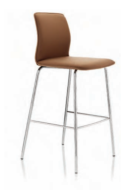
Non-quilted bar stool on a 4 leg frame