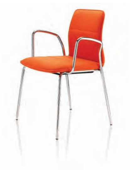
Quilted 4 leg chair with arms