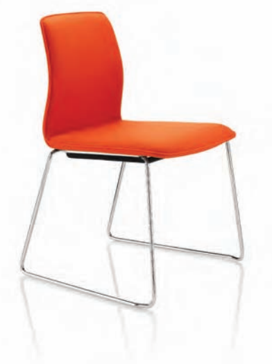
Non - quilted non arm on skid base